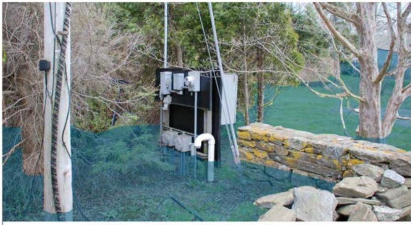
PS #12 Electrical / Controls Panel Looking South - BFE +4

The only way to move the effluent through the system is by strategically placed pump stations. In some cases, those are located at low points and may be vulnerable to flooding regardless of the storm scenario. As part of the assessment, identify those locations that are vulnerable to impacts, assess the structural integrity of those locations and make a determination as to the best alternative solution for the system.