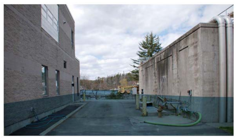
WWTP Looking North Between the Process Building and SBRs - BFE +4