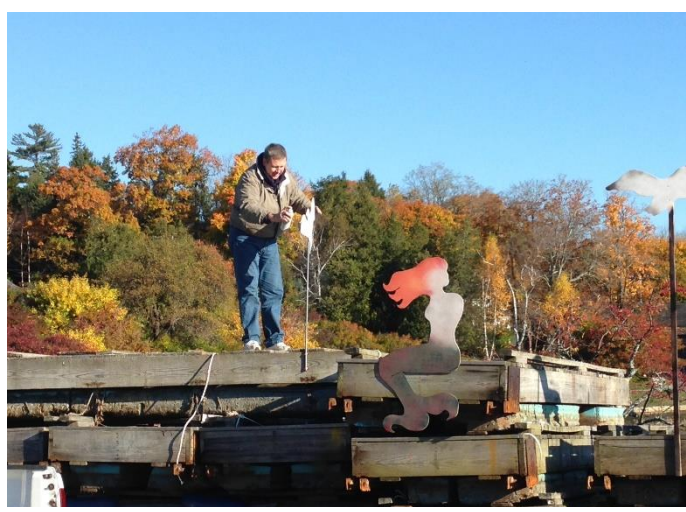
Figure 28: Installing pop-up art created overnight, to use dock storage