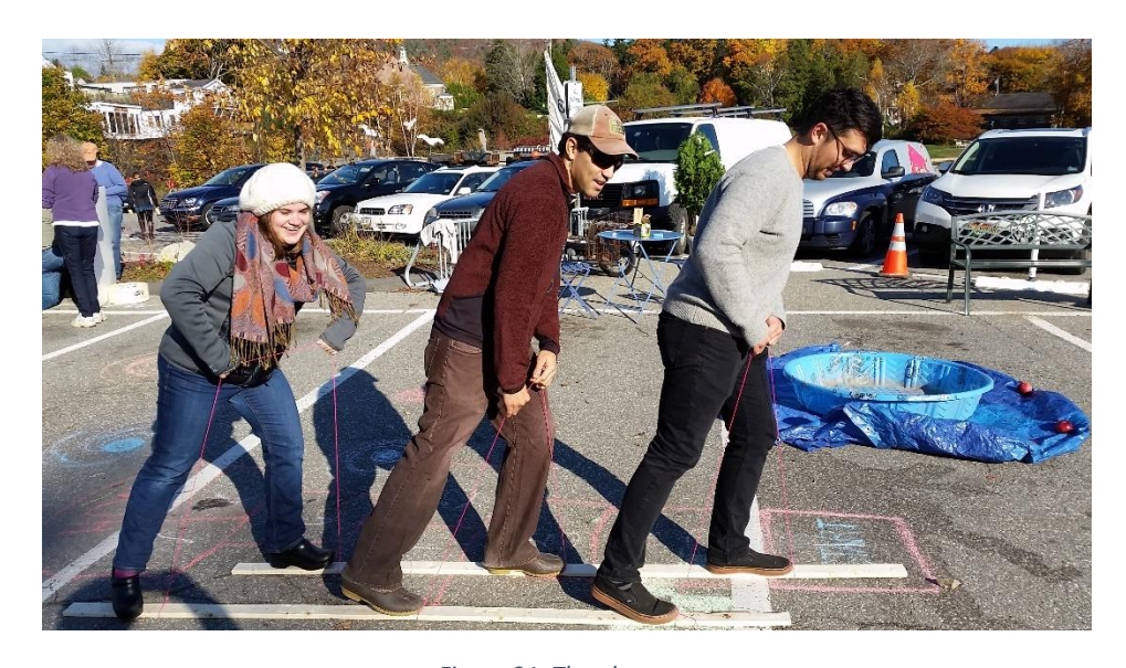
Figure 21: The play area