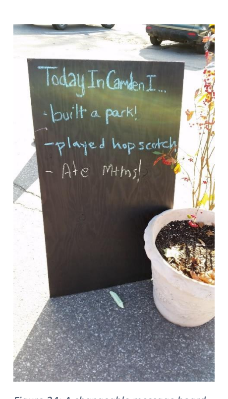
Figure 24: A changeable message board