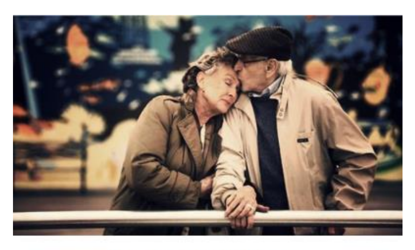
Plan for Happiness!

Nelson presented many additional principles including complementary activities, agglomeration, allowing latent uses to become emergent activities, having activities and amenities, central meeting spots, food trucks, programming, moveable furniture, and edge uses.