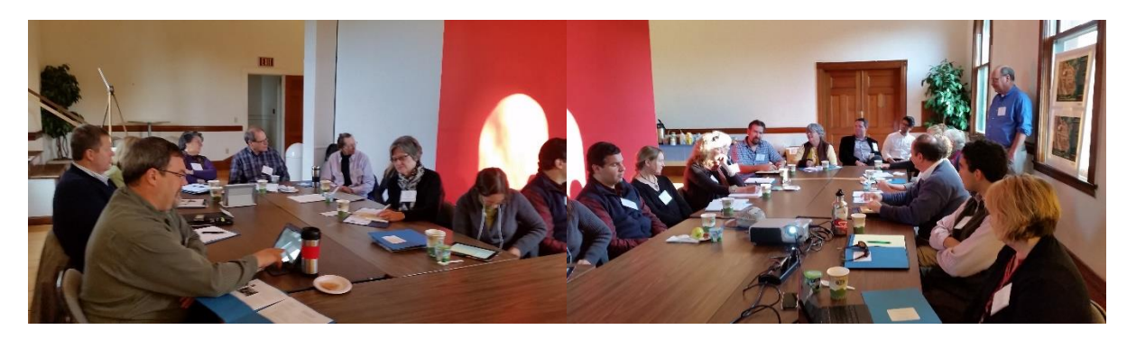
Figure 1: Two photos of many of the participants

Thirty people attended the session including municipal and state staff people as well as community members, lay-planners, and students, all who are interested in shaping the future of their own communities. Attendees included men and women who were business owners, planning board members, town managers, city council and select board members, retirees, non-profit organization staff people and directors, lawyers, health officials, community development officials and code enforcement officers and every day, concerned, community members.