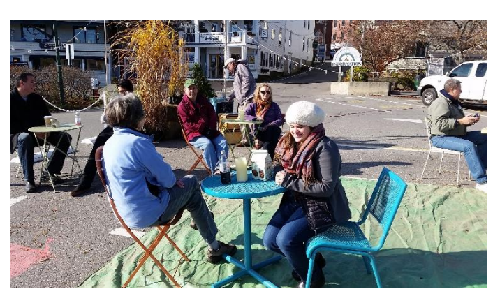
Figure 27: Testing the almost-final product