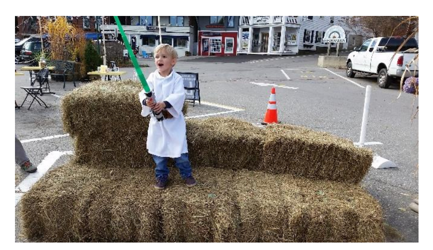
Figure 23: a fun place to be!