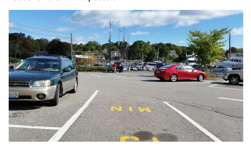
Figure 2: The Public Landing, looking northeast

This session was held in downtown Camden, Maine on the third floor of the Camden Opera House. The hands-on work was one block away in the Camden Public Landing, a parking lot along the board walk and harbor's edge at the back of Main Street and Bayview Street shops, restaurants, hotels and offices. The indoor meeting space was generously donated by the Camden Opera House for the 1½ day session.