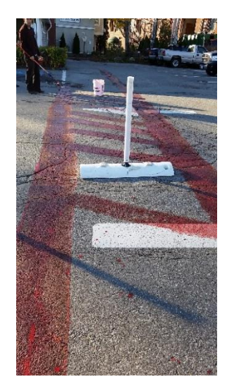
Figure 30: New red walkways lead from the new "space" to the public restrooms, the harbor walkway, and the board walk