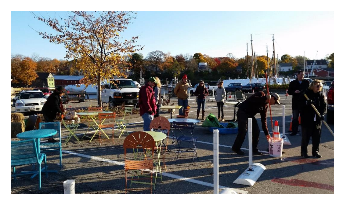
Figure 14: Moveable seating is essential