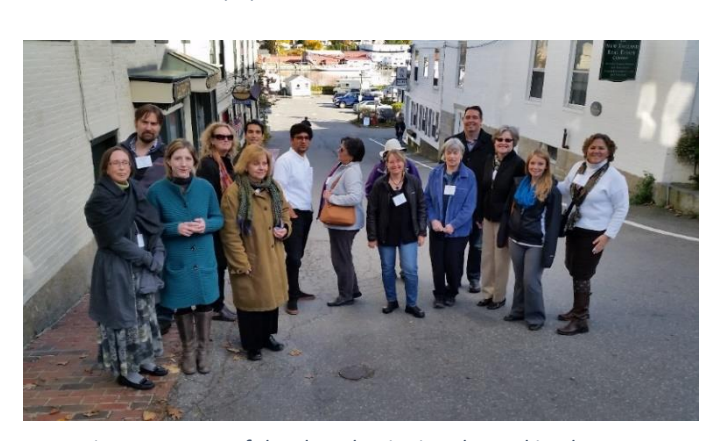
Figure 11: Part of the class, beginning the parking lot tour

The class then toured the parking lot and began to devise their plan for the following day. A dozen parking spaces were blocked off in the late evening and again in the early morning before sun-rise.