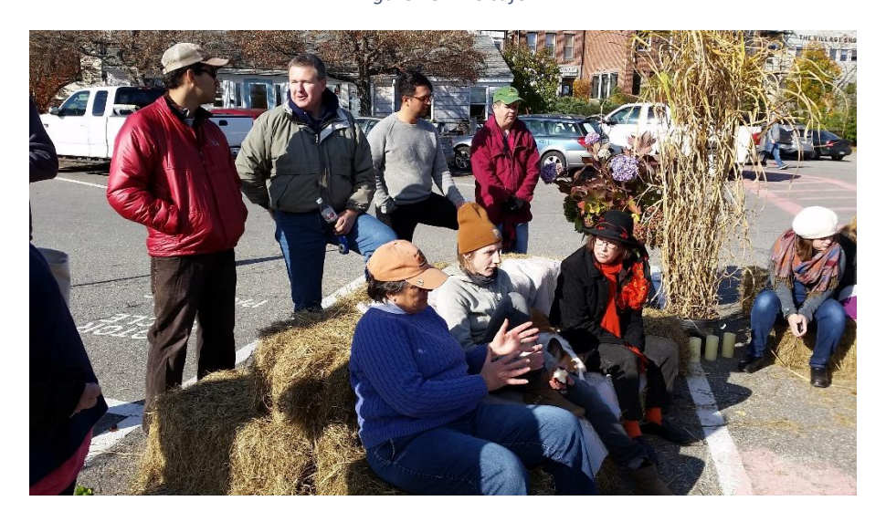
Figure 19: The living room