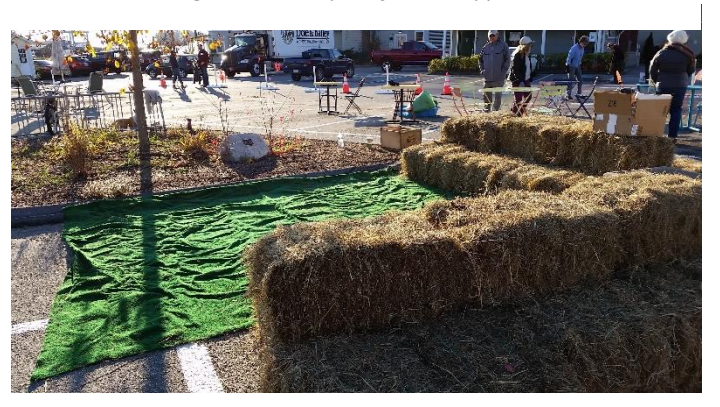
Figure 26: Beginning to design cozy seating spaces