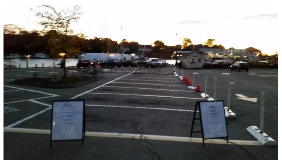
Figure 13: The space, a blank slate - 14 parking spaces were reserved for the project

Eleven parking spaces were blocked out in advance to reserve the space for the demonstration project. In the end, fourteen car (14) spaces plus one motorcycle space were used. It was interesting to note that many of the early parking lot users, were in-town employees and owners from downtown businesses who parked for the entire day, some arriving before 6 am.