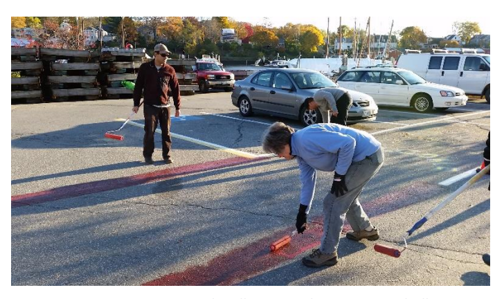
Figure 29: Painting new red walkways with temporary chalk paint