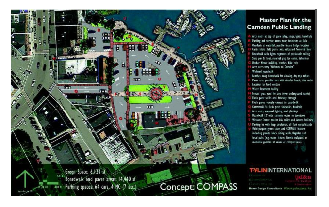
Figure 10: Camden's COMPASS concept plan

The class then toured the parking lot and began to devise their plan for the following day. A dozen parking spaces were blocked off in the late evening and again in the early morning before sun-rise.