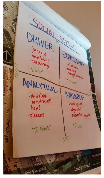
Figure 4: Leadership Training and identifying your social style

This exercise helped to identify one's own strengths and weaknesses and learn to recognize and appreciate the styles of others. This training was essential in carrying out the hands-on field work project the following day.