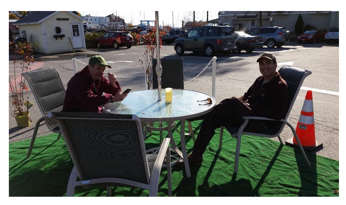
Figure 17: seating on the grass