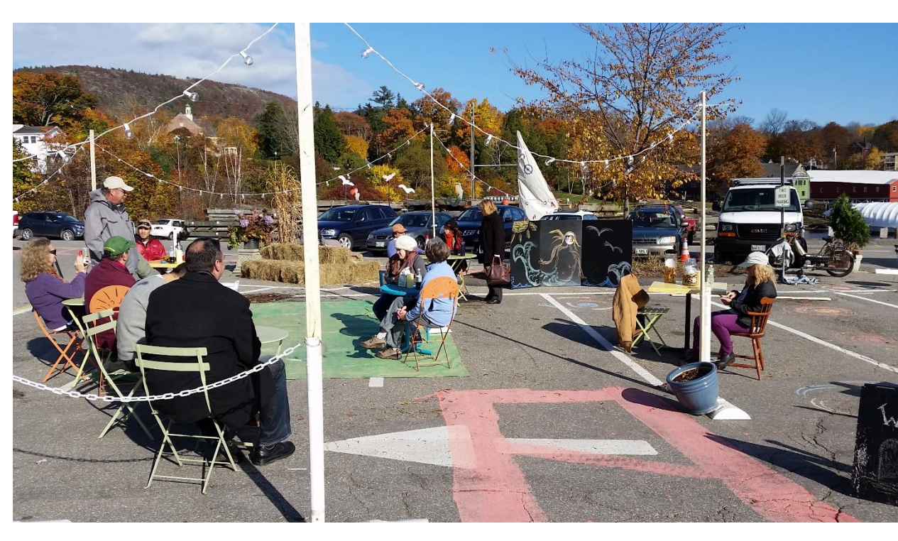
Figure 18: The cafe