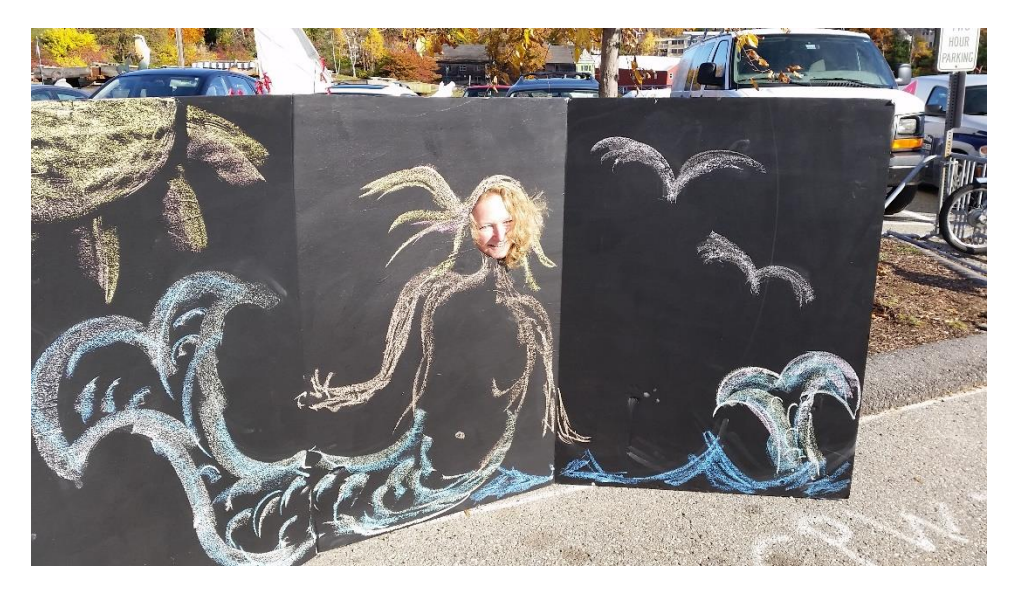
Figure 22: Things to do....