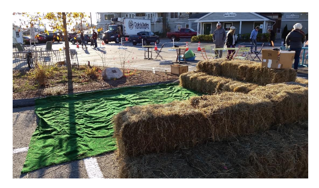
Figure 20: An early version of the living room