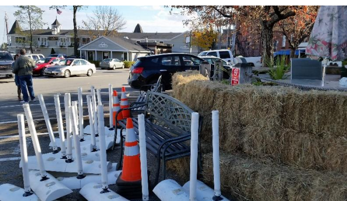
Figure 25: Stockpile of some supplies