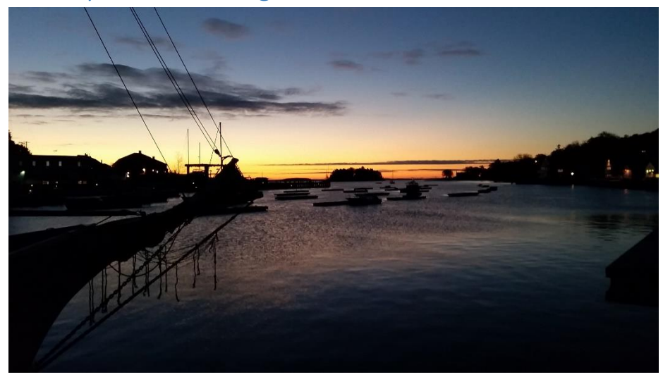
Figure 12: The sun rose over the harbor and the work (and fun!) began....