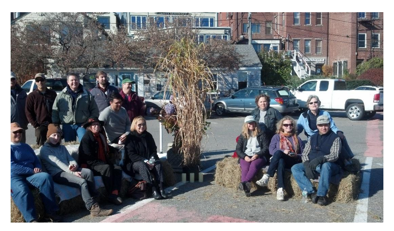
Figure 31: Part of the place-making class