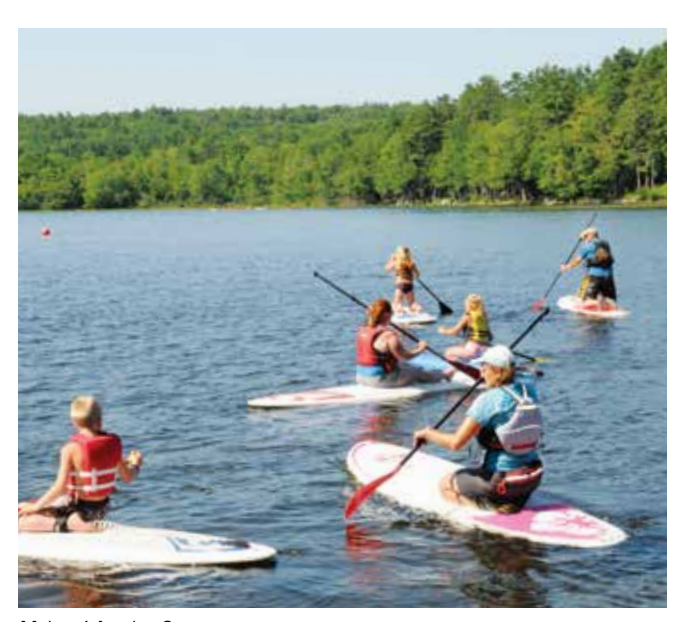
Maine Adaptive Sports

Maine Adaptive Sports & Recreation is a 501(c)(3) organization whose mission is to promote education and training to children and adults with physical disabilities to develop skills and provide enjoyment through active recreation. Our year-round educational programs in a variety of sports take place throughout Maine and are offered free of charge. We provide equipment and volunteer instructors, and cover all access fees to enable disabled individuals, including veterans, to learn alpine skiing, Nordic skiing, snowboarding, snowshoeing, tennis, golf, paddling, cycling, and climbing. Our Veterans No Boundaries Program offers two specialized week-long camps, summer and winter, for veterans and active duty service members with disabilities and their families or caregivers. Run by dedicated volunteers who understand the needs of active duty service personnel and veterans, these camps allow Veterans to learn new sports and skills; gain self-confidence; meet new friends; and reconnect with family members in a stress-free environment.