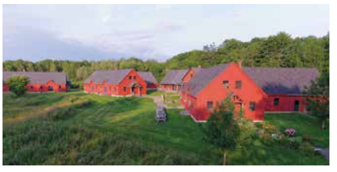
Center for Furniture Craftsmanship

College of the Atlantic is a small liberal arts college of approximately 350 students, located on the coast of Frenchman Bay and next door to Acadia National Park. All COA students design their own program of study in human ecology, the relationship between humans and their natural, social, and built environments. The COA curriculum spans the arts, sciences, humanities, and social sciences, and focuses on complex, real-world environmental, social, and political issues. With a 10:1 student to faculty ratio, experiential courses, extensive field work and research opportunities, and a required internship and capstone senior project, a COA education is designed to prepare students for careers and graduate study in an array of fields. The campus includes two organic farms and two offshore island research