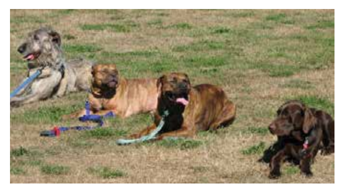
Salute of Service

The Maine Military and Community Network (MMCN) is a statewide effort to understand, prevent, and help address the challenges faced by current and former military members and their families. The Network is comprised of 10 Regional Groups where federal, state, and local military advocates come togeth-er with service members and veterans