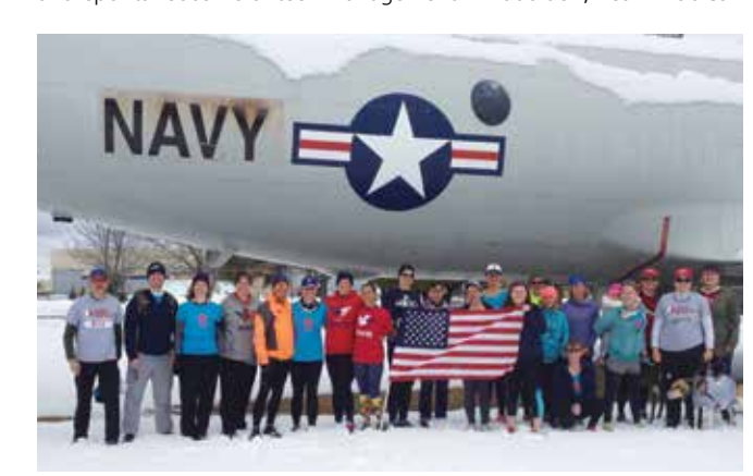
Team Red. White & Blue

Team Rubicon is a non-profit disaster response organization that unites the skills and experiences of military veterans with first responders to rapidly deploy disaster response teams, free of charge to communities across the country. Team Rubicon is active nationally, across the New England region, and locally in Maine. Team Rubicon's disaster response capabilities include incident management, expedient home repair, damage assessment, debris management, hazard mitigation, and spontaneous volunteer management. In addition, Team Rubicon