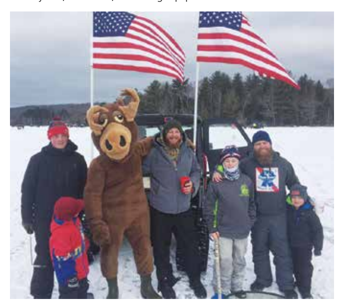
Morale Welfare Recreation Center at Great Pond

Here at Great Pond, we take our mission statement seriously. We go above and beyond for customers to provide the best experience possible in rural Maine. Our facility is located on 375 acres of lakefront property that boasts a sand beach, excellent fishing/boating, wildlife viewing opportunities, and is far removed from the hustle and bustle of modern urban life. We offer a variety of rentals for Active Duty, 100% disabled, retired and civilian military personnel. Those rentals include; Cabins, campsites with electric/water hook-ups, yurts, wilderness sites, canoes, kayaks, motorboats, bicycles, stand up paddleboards, fishing equipment, camping equipment. In the winter: snowshoes, crosscountry skis, ice skates, ice fishing equipment and ice shacks.