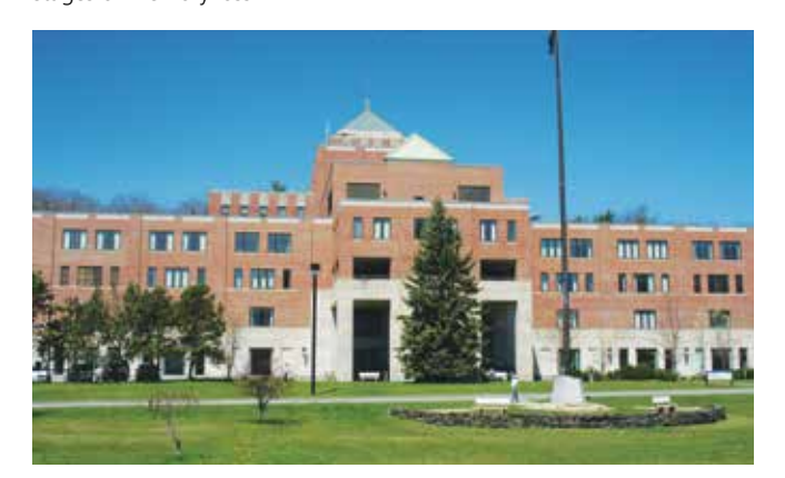
Togus VA Medical Center

Maine Veterans' Homes is an independent, nonprofit organization serving Maine's veterans and their families. Our Augusta Home provides 24 hour nursing coverage in three separate nursing units: a 40 bed rehabilitation and skilled nursing care unit, a 40 bed long-term care unit and a 40 bed secured long-term care unit for memory care residents, and a 30 bed residential care unit designed to meet the needs of those in the early stages of memory loss.