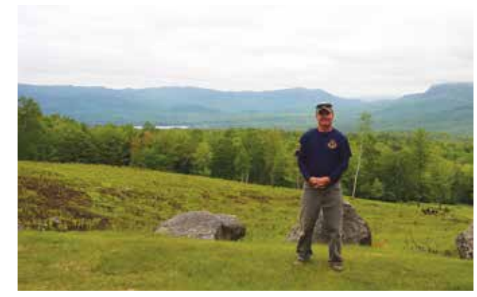
Maine Conservation Corps.