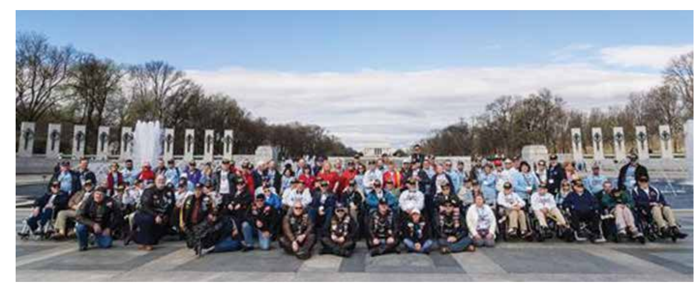
Honor Flight Maine

MOAA is the nation's largest and most influential association of