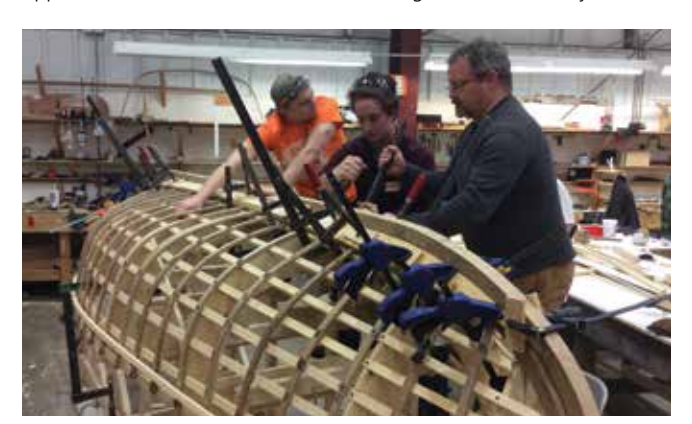
The Landing School of Boatbuilding Design

Purdue University Global is an institution of higher learning dedicated to providing innovative undergraduate, graduate, and continuing professional education. Our programs foster student learning with opportunities to launch, enhance, or change careers in today's diverse