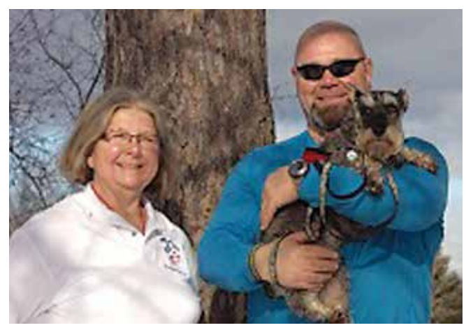
Pets for Vets

K9s on The Front Line's team facilitates a unique program that routinely sees superior outcomes. Many of our staff have first-hand knowledge of the effects of PTSD and have experienced the intimate process of tailoring each dog to the individual's needs. All our trainers are active or retired police K9 handlers with many years of real world experience, arguably the best K9 trainers available. Our team also provides medical